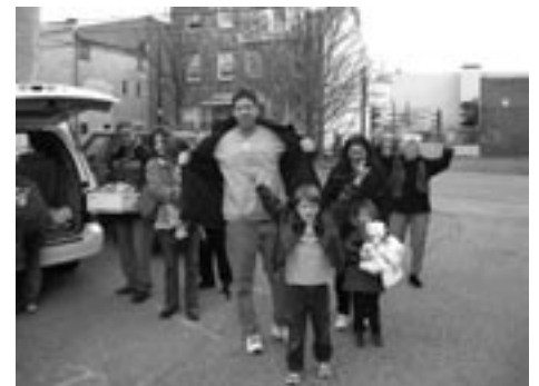
A crew from Church of Our Saviour arrives at Shepherd's Heart in Oakland on January 15.

Be a friend and share this article with as many friends as possible. You could save their lives. And while we are at it, let's invite our friends to receive Jesus as their Lord and Savior so, in case no one is around to intervene on their behalf during a stroke or other crisis, we can rest assured about their eternal salvation. Can we think of three questions to ask that will help us diagnose their need to hear a clear presentation of the gospel?